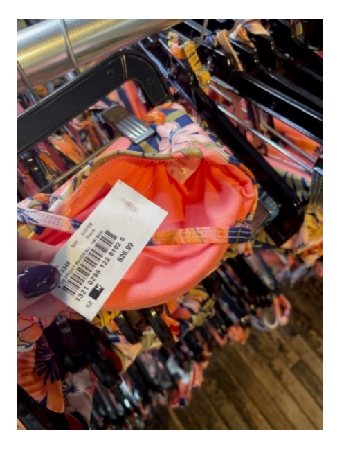
Note: Under no circumstances should any of the price tickets be applied directly into the garment body causing damages to the material/fabric.